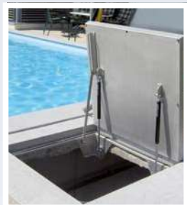
BV-GD 88 built into a swimming pool area