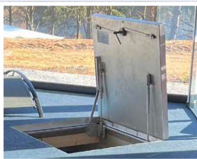
BVE-GDZ built into a family home

To be opened from the underside with the central lock