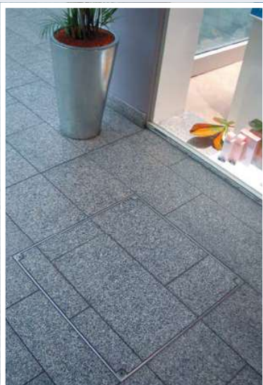
BV in a cafe floor with a granite finish