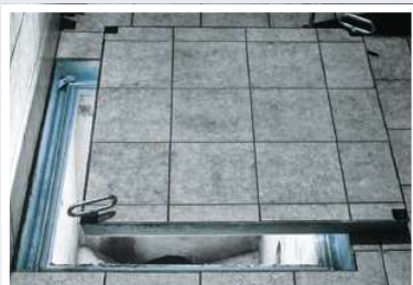
BV over a manhole