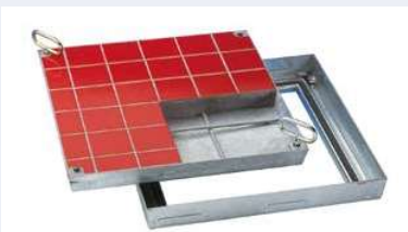
BV partially filled with tiles