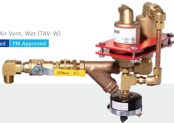
TYCO® Air Vent, Wet (TAV-W)