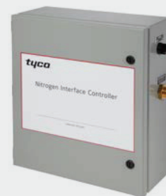
TYCO® Nitrogen Interface Controller (TNIC)