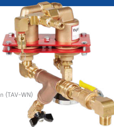
TYCO® Air Vent, Wet - Nitrogen (TAV-WN)

This process replaces the oxygen in the system with nitrogen to stop the corrosion process. Use a TAV-WN air vent and follow the WPNI process for this method.