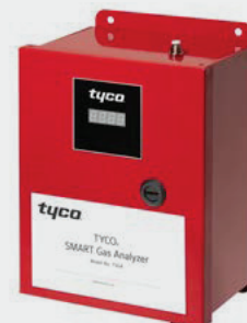
TYCO® SMART Gas Analyzer (TSGA)