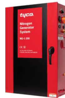
Wall-Mount Nitrogen Generators FM Approved, CE Certification, UL 508A Listed control panel, integrated oil-less air compressor.