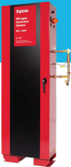
Stand Alone Nitrogen Generators FM Approved, CE Certification, UL 508A Listed control panel, paired with oil-lubricated air compressor. (HP of air compressor ranges from 5-10 hp depending on generator size.)

DPNI is a dilution process that replaces corrosion-causing oxygen with nitrogen as the pressure maintenance gas in dry and pre-action fire sprinkler systems.