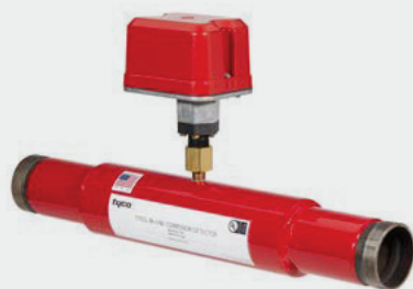
TYCO® In-Line Corrosion Detector (TILD) UL Listed