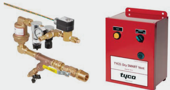
TYCO® Protector Dry SMART Vent (TSV-D)