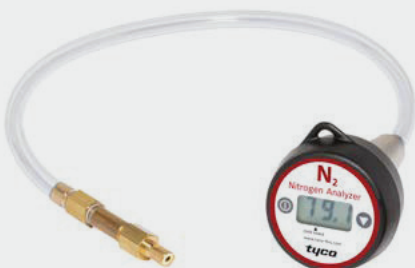
TYCO® Handheld Gas Analyzer (THGA)

We recommend the purchase of a TYCO® Handheld Gas Analyzer with every generator. For additional monitoring options, please speak to your local Johnson Controls Sales representative.