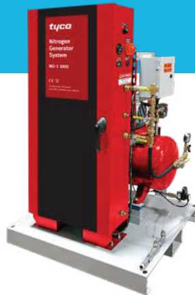
Skid-Mount Nitrogen Generators FM Approved, CE Certification, UL 508A Listed control panel, integrated oil-less air compressor with air receiver tank. Available in the Americas only.