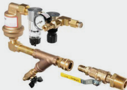
TYCO® Protector Manual Vent (TAV-D)