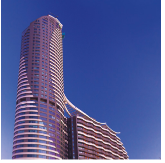
Akasya - Turkey Residence + shopping mall