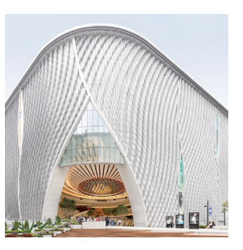
XIQU Center - Hong Kong Concert Hall