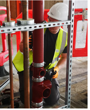
ELIXAIR - Earth to air heat exchanger